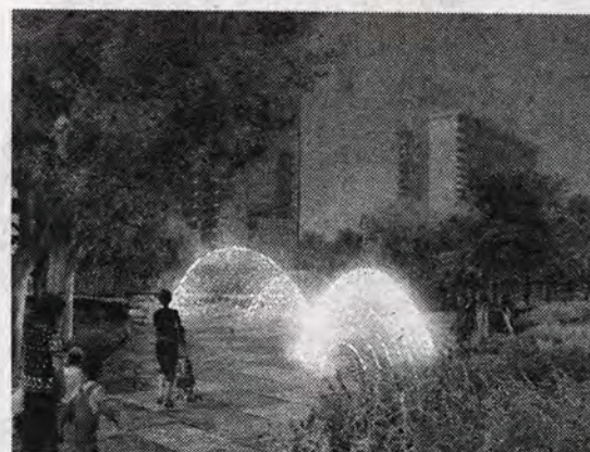
Belo Garden Park (under construction). The $14.5 million, 1.6-acre facility is expected to open early next year. The bulk of its funding came from private sources and city bond money.